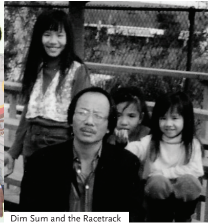
Dim Sum and the Racetrack