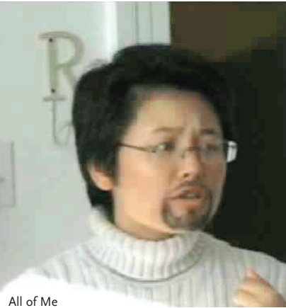
All of Me