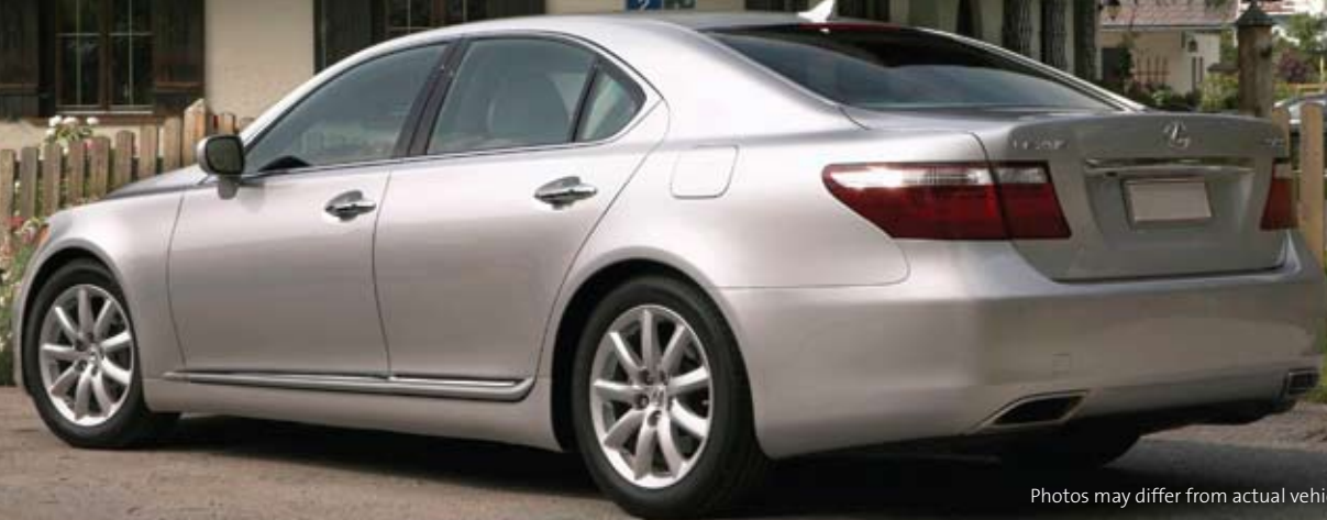
Photos may differ from actual vehicle.