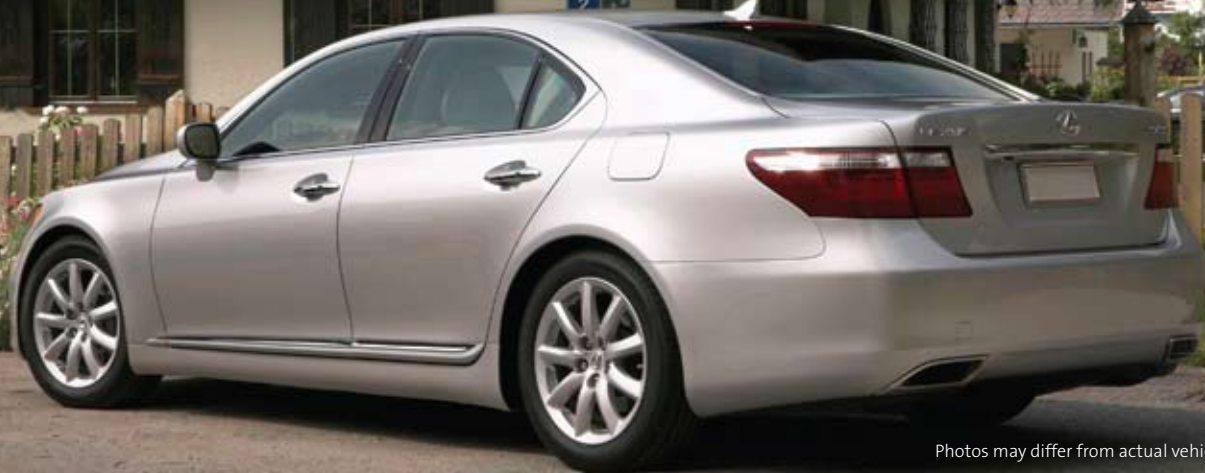
Photos may differ from actual vehicle.